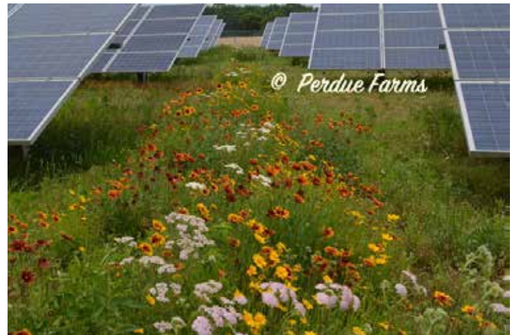
Photo: Salisbury, Maryland: Perdue Farms Headquarters requires pollinator-friendly ground cover throughout its solar farms. Perdue is one of the largest organic poultry producers and organic soybean growers. (Photo courtesy Perdue)

This year’s program will again celebrate the outstanding achievements of young people who have made a positive impact on their communities through beekeeping or other pollinator-related research and activities.