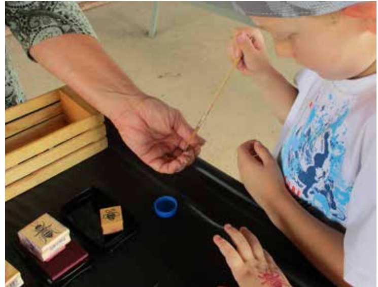
Future Beekeeper cleaning a drone with a paint brush

For the tenth year, I packed up the van to organize a spread for Powell Gardens, Kansas City’s Botanical Garden in Kingsville, MO. This year will be simple for our county just loosened covid-19 restrictions: Teaching hive, package, smoker, hive tool, one jacket, and the stars of the show in the observation hive with the queen and her bees, and a jar of watered down honey for the kids to “feed” the bees! Of course the queen catcher and marking tube for everyone wants to know, “How did the queen get that spot?” Ink pad and various bee stamps were also priority. An alcohol pad to clean the stamp in between uses and of course a jar of hand sanitizer was provided. Powell Gardens gifted their Family Frolic with pollinator kites from the Great American Kites and also assisted kids with